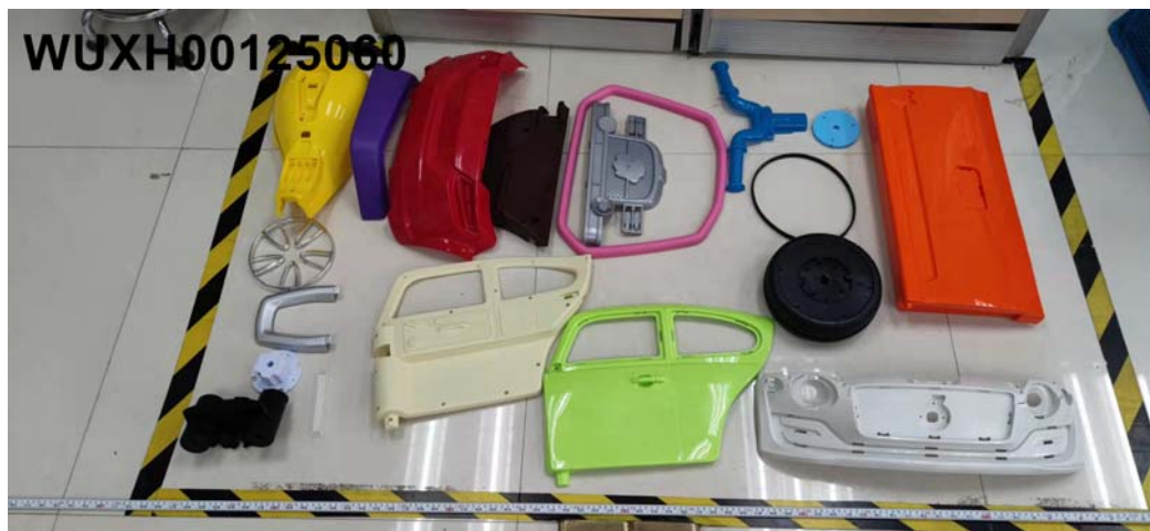
The Sample Were Submitted By Client's, Only For Reference.

Tests Conducted (As Requested By The Applicant)